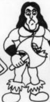
Pythor the Barbarian™