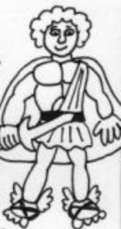
Perseus, son of Zeus!