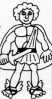
Perseus, son of Zeus!