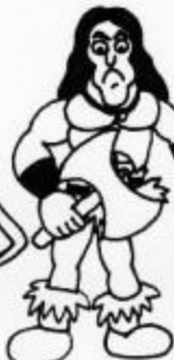
Pythor the Barbarian™